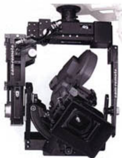
The Third Axis "Dutch" cradle is an accessory that can be added to any Cam-Remote for three axis operation. A custom feature of its operation that won't be found with any other three axis system is a roll-level indicator viewed directly in the operators' monitor.

Additional Control Options: Digital Computer Interface, "Joystick" Control, 90° Wheels Box Control, C.A.T. "Panbar" Fluid Head Control, Serial Link: Up To 2 Miles Via Coax And Wireless Radio Or Microwave Control.